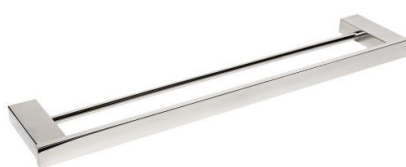
AI1411C Bright finish