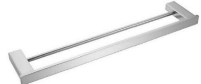
AI1411CS Satin finish