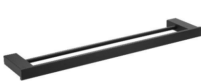
AI1411B Black finish